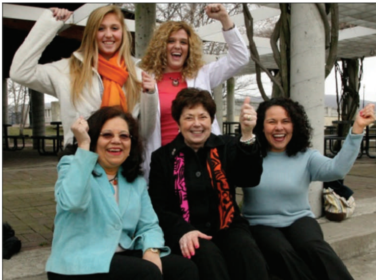
Fund for Women members cheer our success!