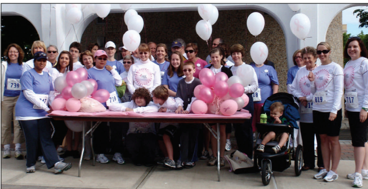
FFW Race for the Cure team raised over $5,000 for our local Susan G. Komen affiliate.

Members and friends of the Fund for Women formed a team and energetically participated in the 2010 Twin Tiers Race for the Cure in on May 16. Team members came to honor, celebrate or remember those whose lives have been touched by breast cancer. Together the FFW team raised over $5,000 for the local affiliate of the Susan G. Komen Foundation. This contribution was the largest raised by any participating team! We look forward to topping our results in 2011— race date is May 15.