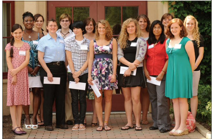
Some of the 2010 Fund for Women grant recipients who attended the first annual brunch in June at Elmira Country Club